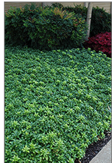
Green Sheen Japanese Spurge

North Hanley 4215 North Hanley Road St. Louis, MO 63121 (314) 428.9878