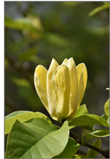
Yellow Bird Magnolia flowers