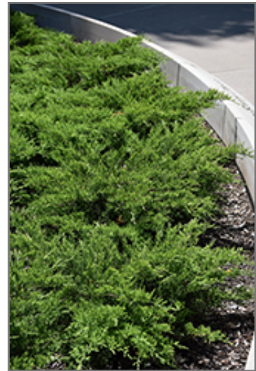
Broadmoor Juniper