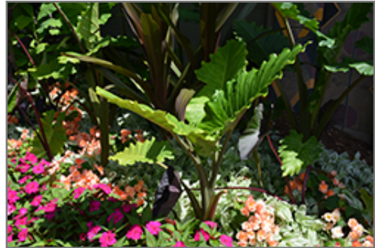
Elephant's Ear