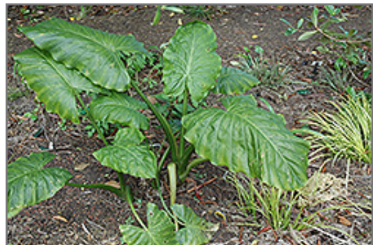
Elephant's Ear

North Hanley 4215 North Hanley Road St. Louis, MO 63121 (314) 428.9878