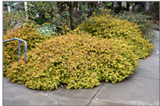
Kaleidoscope Abelia

Kaleidoscope Abelia will grow to be about 30 inches tall at maturity, with a spread of 4 feet. It tends to fill out right to the ground and therefore doesn't necessarily require facer plants in front. It grows at a slow rate, and under ideal conditions can be expected to live for approximately 30 years.