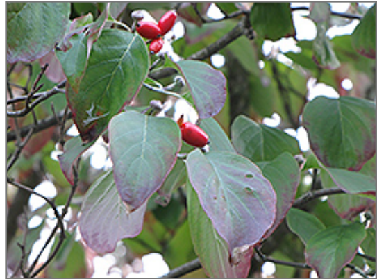
Cherokee Chief Flowering Dogwood fruit

This tree does best in full sun to partial shade. You may want to keep it away from hot, dry locations that receive direct afternoon sun or which get reflected sunlight, such as against the south side of a white wall. It requires an evenly moist well-drained soil for optimal growth, but will die in standing water. It is very fussy about its soil conditions and must have rich, acidic soils to ensure success, and is subject to chlorosis (yellowing) of the foliage in alkaline soils. It is quite intolerant of urban pollution, therefore inner city or urban streetside plantings are best avoided, and will benefit from being planted in a relatively sheltered location. Consider applying a thick mulch around the root zone in winter to protect it in exposed locations or colder microclimates. This is a selection of a native North American species.