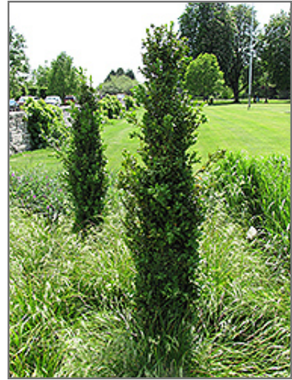
Graham Blandy Boxwood