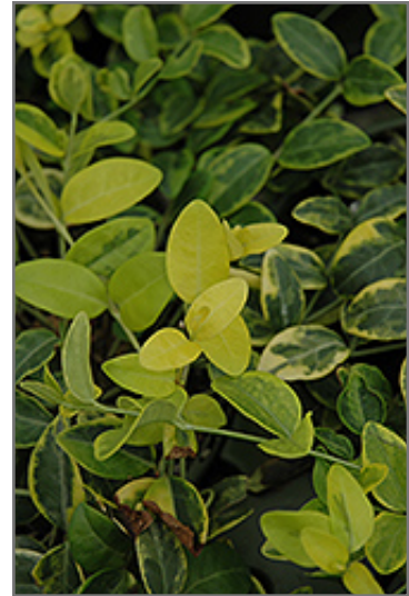
Sunny Skies Periwinkle flowers

Sunny Skies Periwinkle is recommended for the following landscape applications;