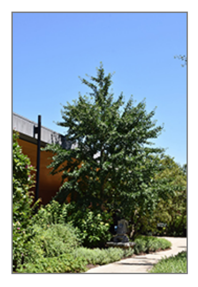
Autumn Gold Ginkgo

North Hanley 4215 North Hanley Road St. Louis, MO 63121 (314) 428.9878