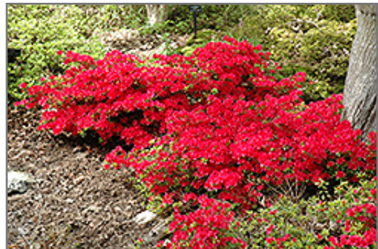
Hino Crimson Azalea in bloom