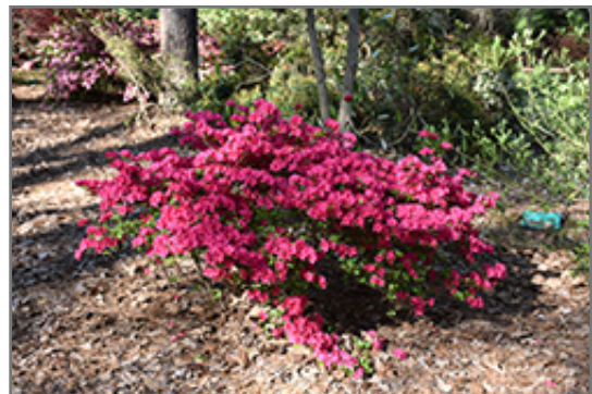
Girard's Fuchsia Evergreen Azalea in bloom