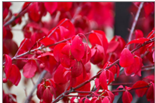
Rudy Haag Burning Bush in fall

North Hanley 4215 North Hanley Road St. Louis, MO 63121 (314) 428.9878