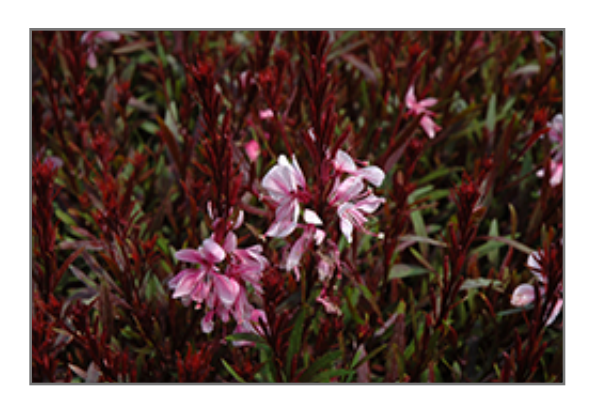
Passionate Blush Gaura flowers