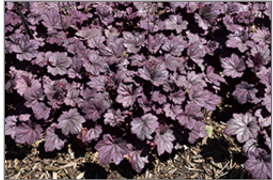
Sugar Plum Coral Bells

Sugar Plum Coral Bells will grow to be about 12 inches tall at maturity extending to 24 inches tall with the flowers, with a spread of 18 inches. When grown in masses or used as a bedding plant, individual plants should be spaced approximately 15 inches apart. Its foliage tends to remain dense right to the ground, not requiring facer plants in front. It grows at a medium rate, and under ideal conditions can be expected to live for approximately 10 years. As an evergreen perennial, this plant will typically keep its form and foliage year-round.