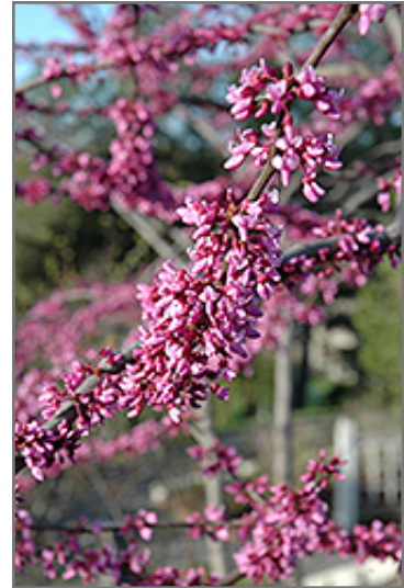
Northern Strain Redbud flowers