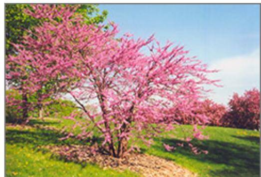
Northern Strain Redbud in bloom