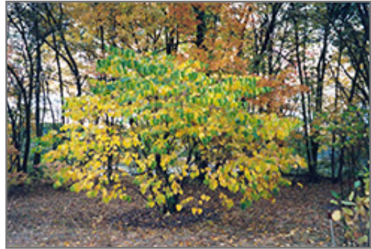
Northern Strain Redbud in fall

Northern Strain Redbud will grow to be about 25 feet tall at maturity, with a spread of 30 feet. It has a low canopy with a typical clearance of 3 feet from the ground, and is suitable for planting under power lines. It grows at a medium rate, and under ideal conditions can be expected to live for 60 years or more.