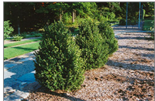
Green Mountain Boxwood

North Hanley 4215 North Hanley Road St. Louis, MO 63121 (314) 428.9878