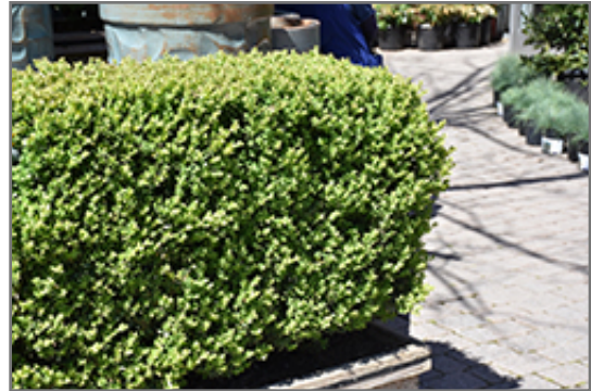
Green Mountain Boxwood