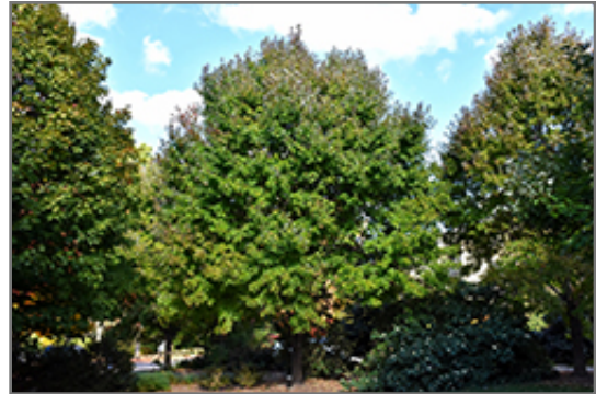
Autumn Flame Red Maple

This tree should only be grown in full sunlight. It is quite adaptable, preferring to grow in average to wet conditions, and will even tolerate some standing water. It is not particular as to soil type, but has a definite preference for acidic soils, and is subject to chlorosis (yellowing) of the foliage in alkaline soils. It is somewhat tolerant of urban pollution. This is a selection of a native North American species.