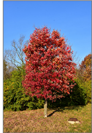
Autumn Flame Red Maple in fall

Autumn Flame Red Maple is recommended for the following landscape applications;