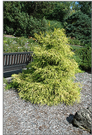
Lemon Thread Falsecypress

Lemon Thread Falsecypress is recommended for the following landscape applications;