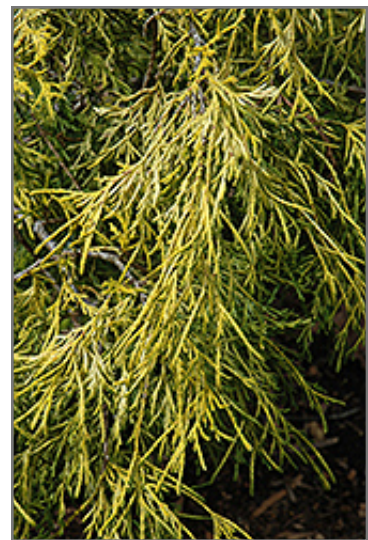
Lemon Thread Falsecypress foliage

North Hanley 4215 North Hanley Road St. Louis, MO 63121 (314) 428.9878