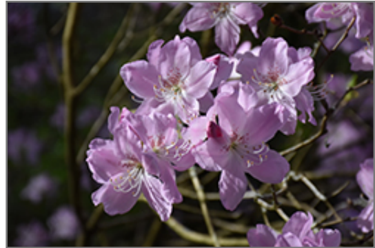
Royal Azalea flowers

Royal Azalea is recommended for the following landscape applications;