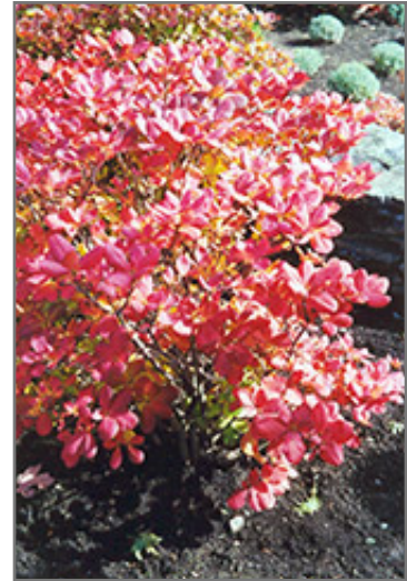
Royal Azalea in fall

* This is a 'special order' plant - contact store for details