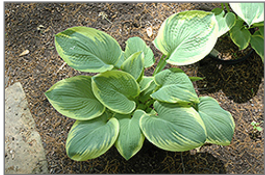
Robert Frost Hosta

Robert Frost Hosta is recommended for the following landscape applications;