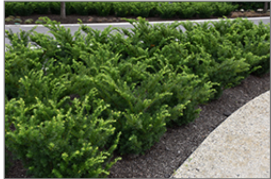
Densiformis Yew