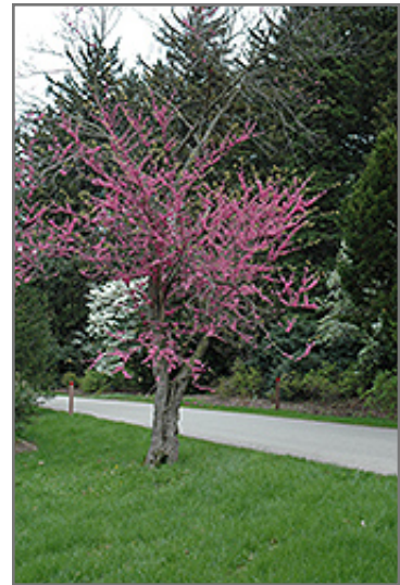
Pinkbud Redbud in bloom

Pinkbud Redbud is recommended for the following landscape applications;