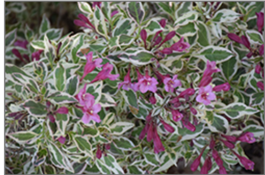
My Monet Weigela flowers

My Monet Weigela is recommended for the following landscape applications;