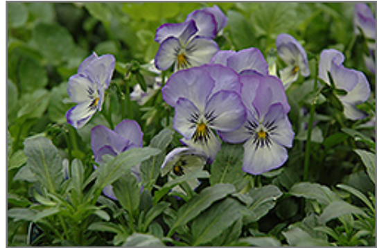
Coconut Swirl Sorbet Pansy flowers