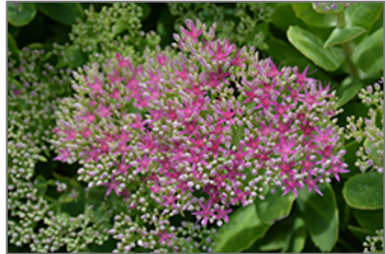
Neon Stonecrop flower buds