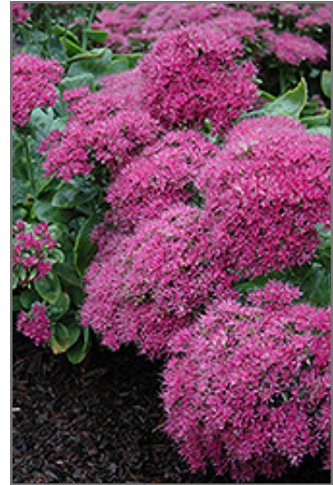
Neon Stonecrop flowers

Neon Stonecrop is a dense herbaceous perennial with an upright spreading habit of growth. Its relatively coarse texture can be used to stand it apart from other garden plants with finer foliage.