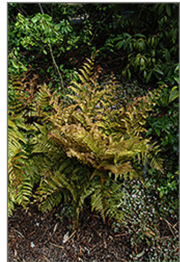
Autumn Fern

North Hanley 4215 North Hanley Road St. Louis, MO 63121 (314) 428.9878