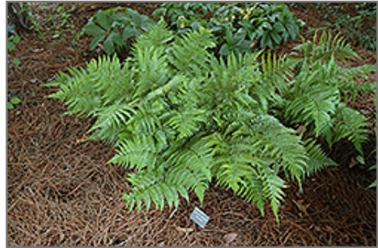
Autumn Fern

Autumn Fern will grow to be about 18 inches tall at maturity, with a spread of 18 inches. Its foliage tends to remain dense right to the ground, not requiring facer plants in front. It grows at a medium rate, and under ideal conditions can be expected to live for approximately 15 years. As an evergreen perennial, this plant will typically keep its form and foliage year-round.