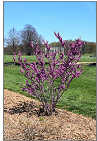
Celestial Plum Redbud in bloom

Celestial Plum Redbud is recommended for the following landscape applications;