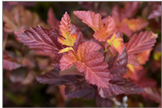
Center Glow Ninebark foliage

Center Glow Ninebark is recommended for the following landscape applications;