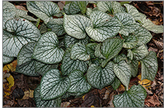
Jack Frost Bugloss