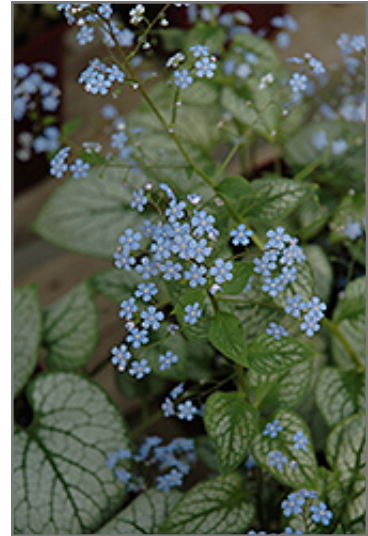
Jack Frost Bugloss flowers

Jack Frost Bugloss is a fine choice for the garden, but it is also a good selection for planting in outdoor pots and containers. It is often used as a 'filler' in the 'spiller-thriller-filler' container combination, providing a mass of flowers and foliage against which the thriller plants stand out. Note that when growing plants in outdoor containers and baskets, they may require more frequent waterings than they would in the yard or garden.