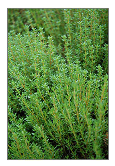
Common Thyme foliage

North Hanley 4215 North Hanley Road St. Louis, MO 63121 (314) 428.9878