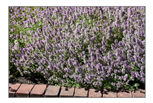
Common Thyme in bloom

Common Thyme is smothered in stunning clusters of pink flowers at the ends of the stems from early to mid summer. Its attractive tiny fragrant round leaves remain grayish green in color throughout the year.