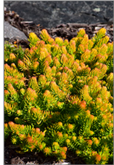
Angelina Stonecrop foliage

Angelina Stonecrop is recommended for the following landscape applications;