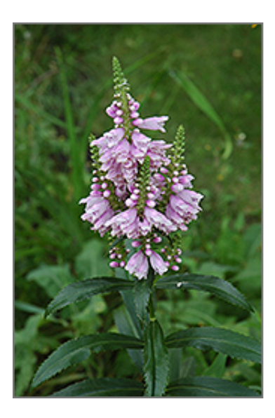
Obedient Plant flowers