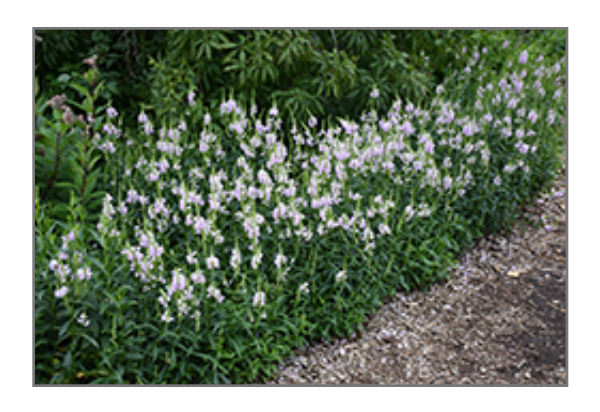
Obedient Plant in bloom