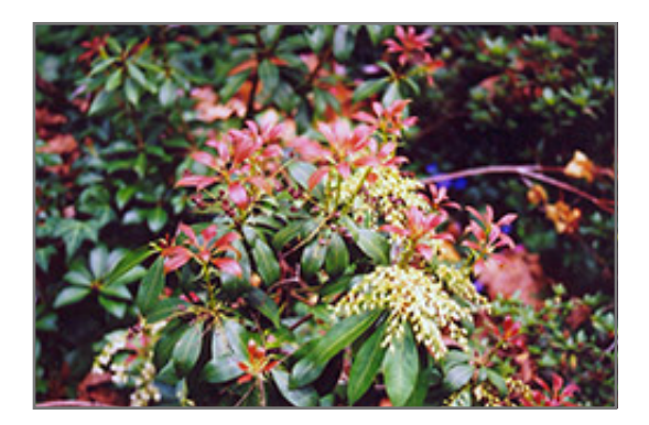
Japanese Pieris foliage

This shrub does best in full sun to partial shade. It requires an evenly moist well-drained soil for optimal growth, but will die in standing water. It is very fussy about its soil conditions and must have rich, acidic soils to ensure success, and is subject to chlorosis (yellowing) of the foliage in alkaline soils. It is somewhat tolerant of urban pollution, and will benefit from being planted in a relatively sheltered location. Consider applying a thick mulch around the root zone in winter to protect it in exposed locations or colder microclimates. This species is not originally from North America, and parts of it are known to be toxic to humans and animals, so care should be exercised in planting it around children and pets.