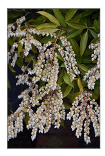
Japanese Pieris flowers

This shrub will require occasional maintenance and upkeep, and should only be pruned after flowering to avoid removing any of the current season's flowers. Deer don't particularly care for this plant and will usually leave it alone in favor of tastier treats. It has no significant negative characteristics.