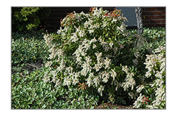
Japanese Pieris in bloom

North Hanley 4215 North Hanley Road St. Louis, MO 63121 (314) 428.9878