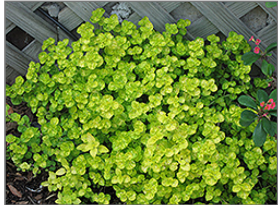
Golden Oregano

Aside from its primary use as an edible, Golden Oregano is suitable for the following landscape applications;