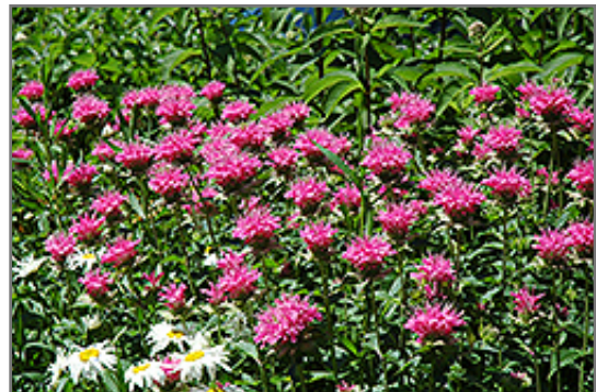
Marshall's Delight Beebalm flowers

North Hanley 4215 North Hanley Road St. Louis, MO 63121 (314) 428.9878