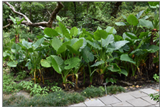
Calidora Elephant's Ear

Calidora Elephant's Ear is recommended for the following landscape applications;