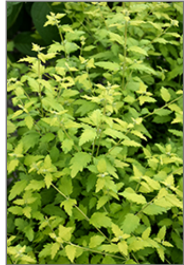
Sunshine Blue II Caryopteris foliage

Sunshine Blue II Caryopteris makes a fine choice for the outdoor landscape, but it is also well-suited for use in outdoor pots and containers. With its upright habit of growth, it is best suited for use as a 'thriller' in the 'spiller-thriller-filler' container combination; plant it near the center of the pot, surrounded by smaller plants and those that spill over the edges. It is even sizeable enough that it can be grown alone in a suitable container. Note that when grown in a container, it may not perform exactly as indicated on the tag - this is to be expected. Also note that when growing plants in outdoor containers and baskets, they may require more frequent waterings than they would in the yard or garden.