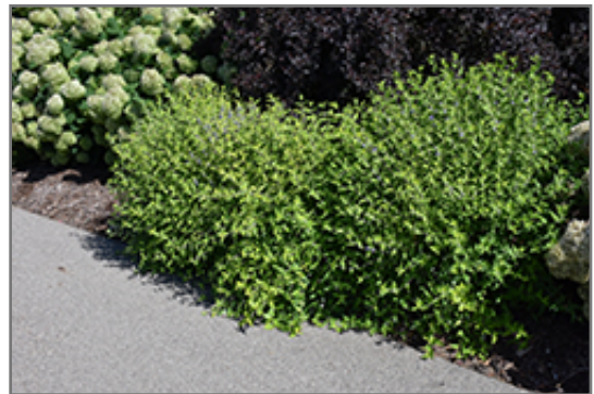
Sunshine Blue II Caryopteris in bloom

North Hanley 4215 North Hanley Road St. Louis, MO 63121 (314) 428.9878