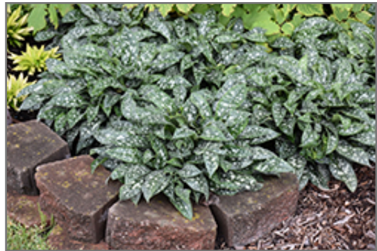
Twinkle Toes Lungwort

Twinkle Toes Lungwort will grow to be about 12 inches tall at maturity, with a spread of 18 inches. When grown in masses or used as a bedding plant, individual plants should be spaced approximately 15 inches apart. Its foliage tends to remain dense right to the ground, not requiring facer plants in front. It grows at a medium rate, and under ideal conditions can be expected to live for approximately 10 years. As an herbaceous perennial, this plant will usually die back to the crown each winter, and will regrow from the base each spring. Be careful not to disturb the crown in late winter when it may not be readily seen!