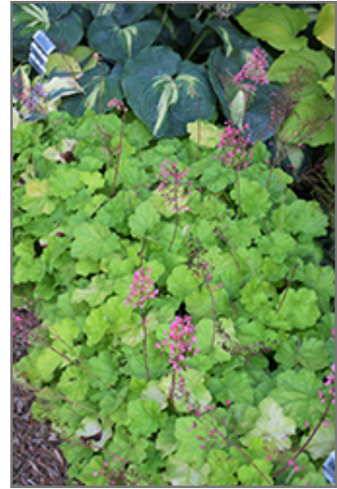
Primo Pretty Pistachio Coral Bells in bloom

This is a relatively low maintenance plant, and should be cut back in late fall in preparation for winter. It is a good choice for attracting butterflies and hummingbirds to your yard. It has no significant negative characteristics.