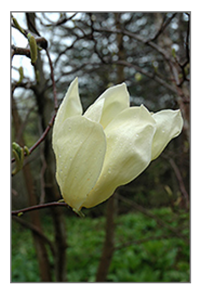
Cucumber Magnolia flowers