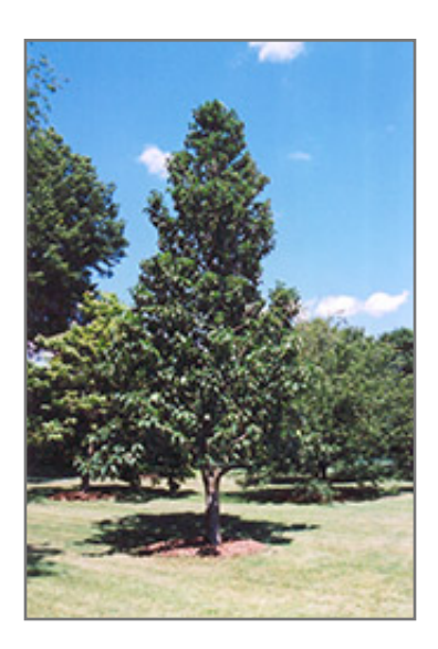
Cucumber Magnolia

* This is a 'special order' plant - contact store for details