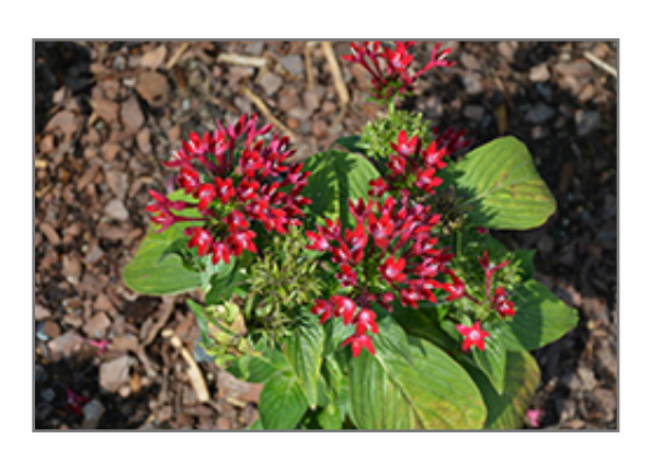
Starcluster Red Star Flower flowers