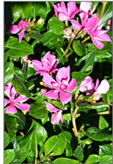
Soiree Kawaii Double Pink Vinca flowers

Soiree Kawaii Double Pink Vinca is recommended for the following landscape applications;