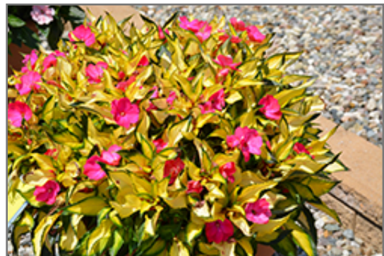
SunPatiens Compact Tropical Rose New Guinea Impatiens in bloom

North Hanley 4215 North Hanley Road St. Louis, MO 63121 (314) 428.9878