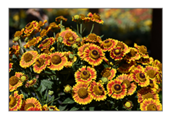
Mariachi Fuego Sneezeweed flowers

Mariachi Fuego Sneezeweed is recommended for the following landscape applications;