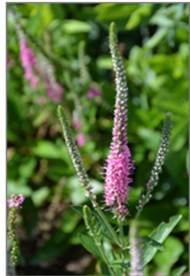
Perfectly Picasso Speedwell flowers

North Hanley 4215 North Hanley Road St. Louis, MO 63121 (314) 428.9878