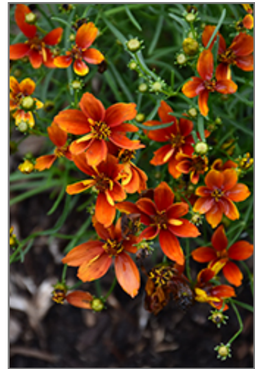
Sizzle And Spice Crazy Cayenne Tickseed flowers

Sizzle And Spice Crazy Cayenne Tickseed is recommended for the following landscape applications;