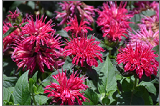
Balmy Rose Beebalm flowers