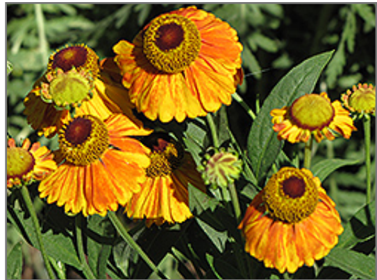
Mardi Gras Sneezeweed flowers

Mardi Gras Sneezeweed is an herbaceous perennial with an upright spreading habit of growth. Its medium texture blends into the garden, but can always be balanced by a couple of finer or coarser plants for an effective composition.