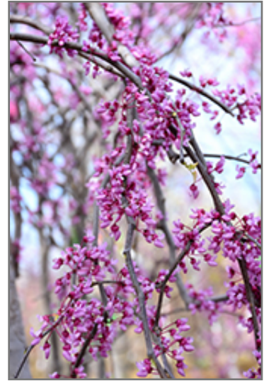
Pink Heartbreaker Redbud flowers

Pink Heartbreaker Redbud is recommended for the following landscape applications;