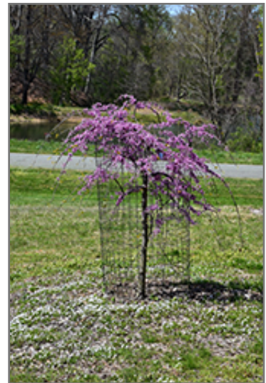
Pink Heartbreaker Redbud in bloom

North Hanley 4215 North Hanley Road St. Louis, MO 63121 (314) 428.9878