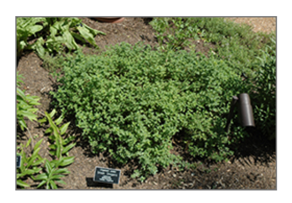
Greek Oregano

This is an herbaceous evergreen perennial herb with a mounded form. It brings an extremely fine and delicate texture to the garden composition and should be used to full effect. This is a relatively low maintenance plant, and should be cut back in late fall in preparation for winter. It is a good choice for attracting bees and butterflies to your yard, but is not particularly attractive to deer who tend to leave it alone in favor of tastier treats. It has no significant negative characteristics.